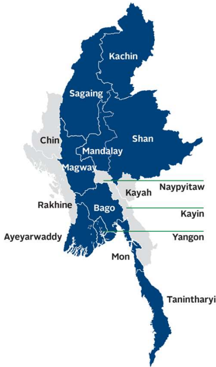
Figure 1: Geographic distribution of TB community network

In Myanmar, a tuberculosis (TB) high burden country, widening inequality due to persistent political instability and the unprecedented effects of the COVID-19 pandemic has hindered TB service access. Within this compromised national health system, grassroots leadership is required to revitalize TB elimination efforts, including TB active case finding, treatment support, and prevention.